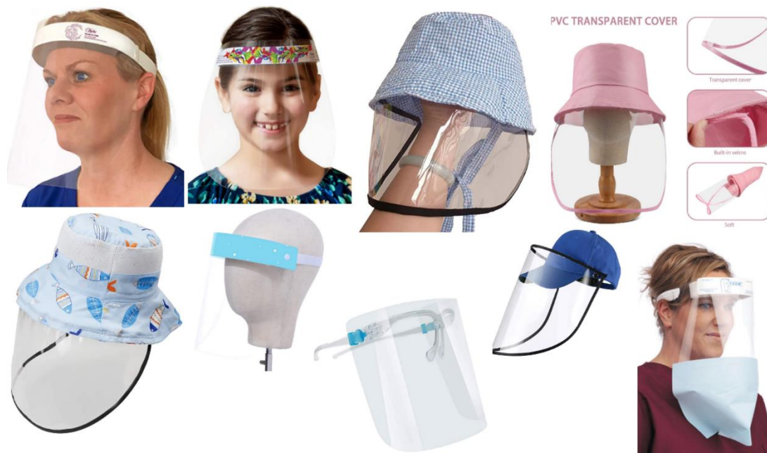
Figure 7. Just a few examples of face shields that will require attachment of a 6" (minimum) cloth drape that is tucked into shirt or wrapped around the neck to close the open edges.