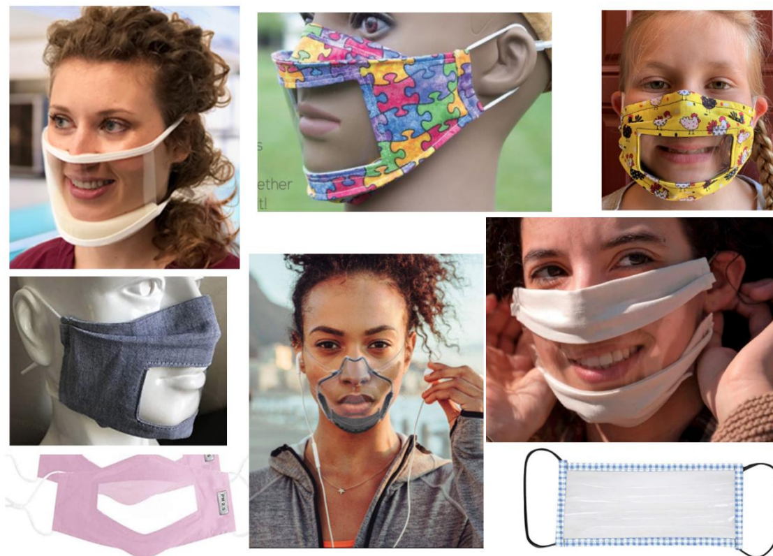
Figure 5. Just a few examples of masks that show facial expressions.