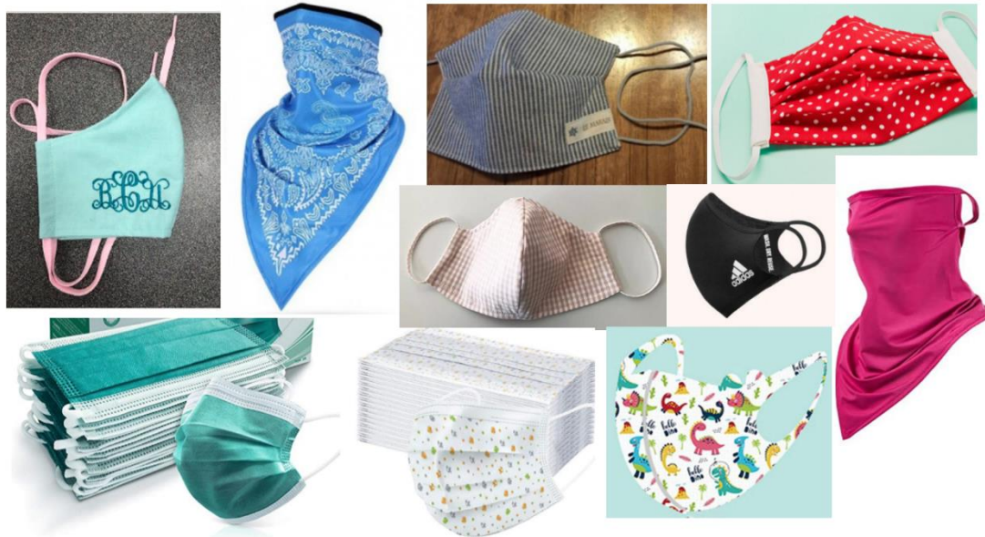
Figure 4. Just a few examples of Cloth face coverings.