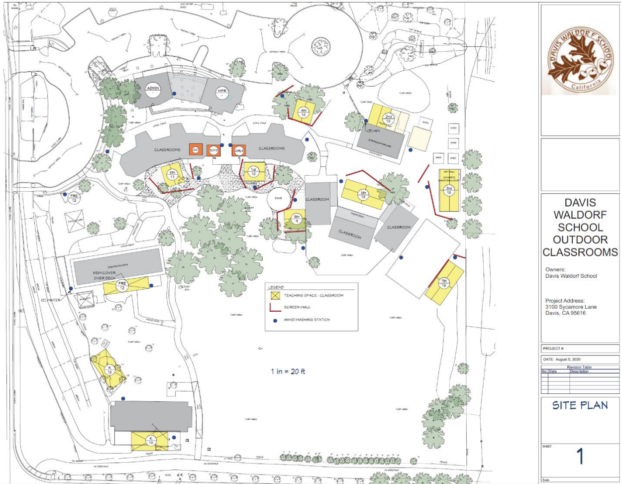
Figure 1 Outdoor classrooms and handwashing stations are indicated on this map.