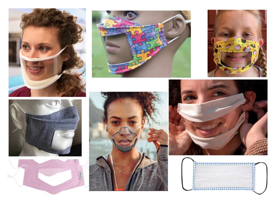
Figure 2. Just a few examples of masks that show facial expressions.