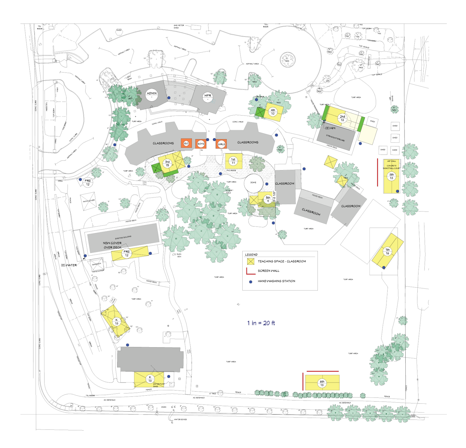
Figure 1. Outdoor classrooms and handwashing stations are indicated on this map.