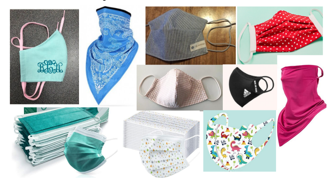
Figure 1. Just a few examples of cloth face coverings.

1. A cloth face covering is a 2-layer ( minimum ) material that covers the nose and mouth. It may also contain a filter. It can be secured with ties or straps around the ears or head, or simply wrapped around the lower face. It can be made of a variety of materials, such as cotton, silk, or linen. See Figure 1.